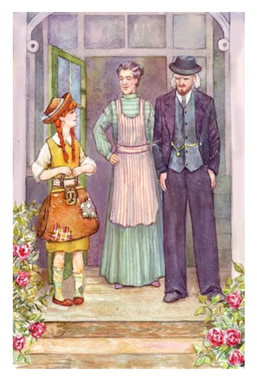
Marilla opened the door. She was surprised to see a girl.