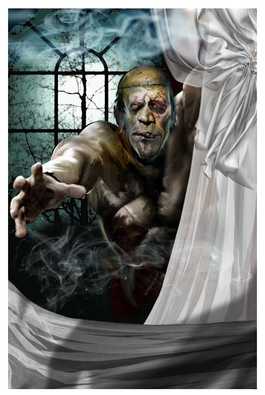
I woke up. The monster was standing by my bed. He was looking at me.