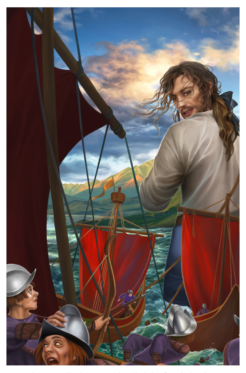
Then I walked away and pulled the fleet behind me.