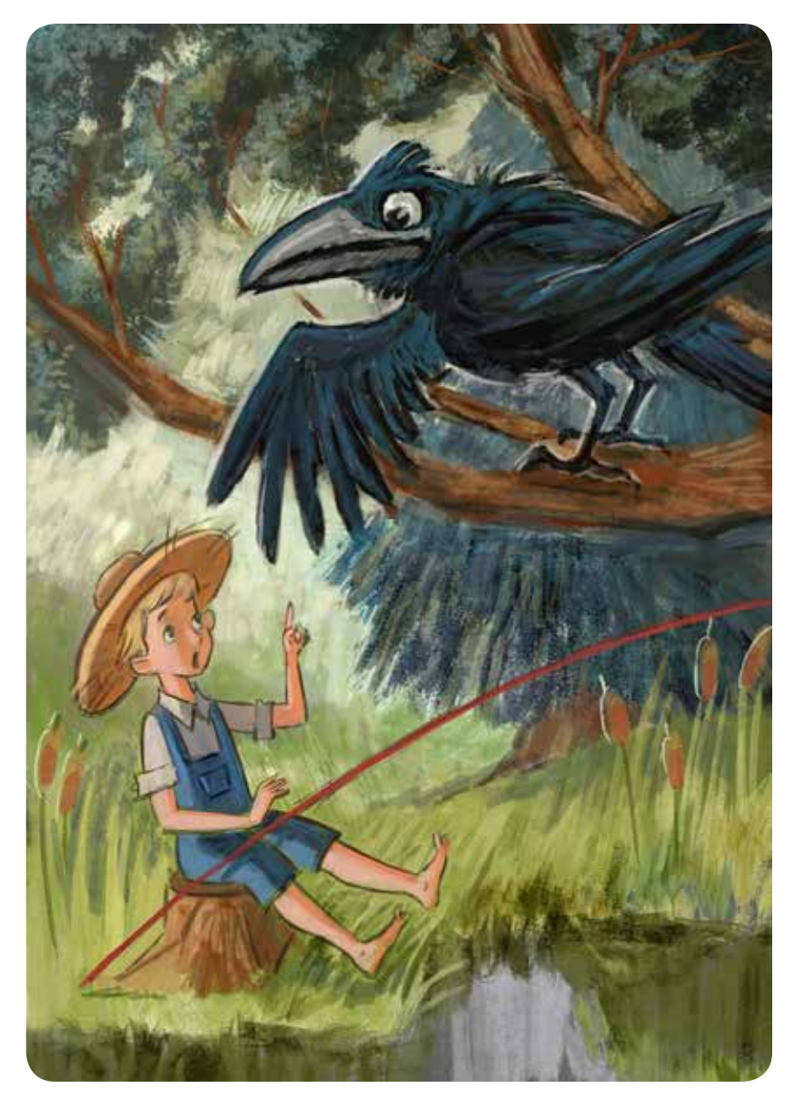
"How can you talk?" Billy says. "You are just a crow!"