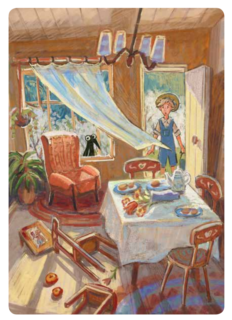
Billy looks for his mum and dad everywhere in the house. He cannot find them.