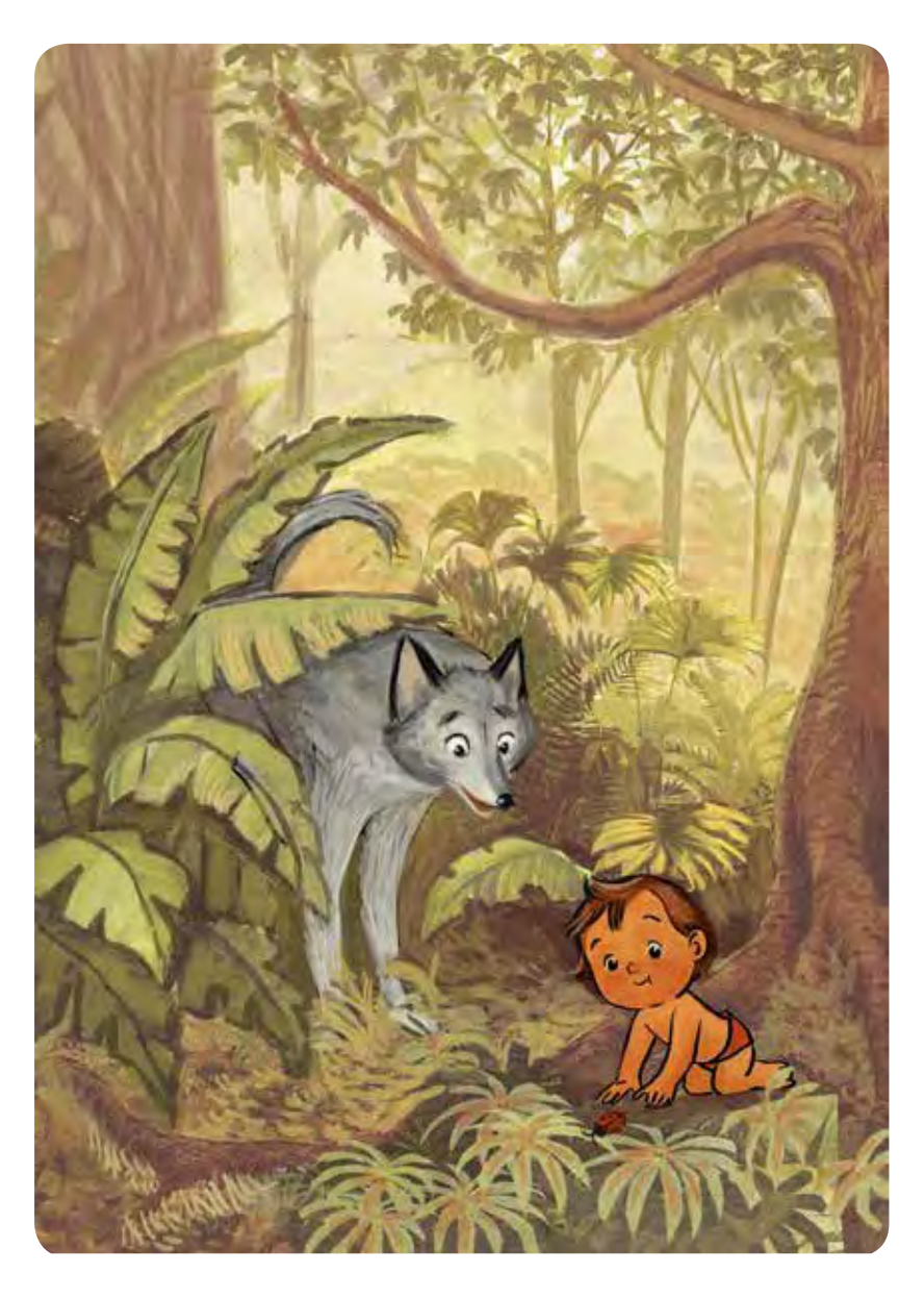
Father Wolf was walking through the jungle. A man cub walked up to him.